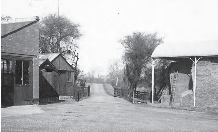
Foxbury farm buildings