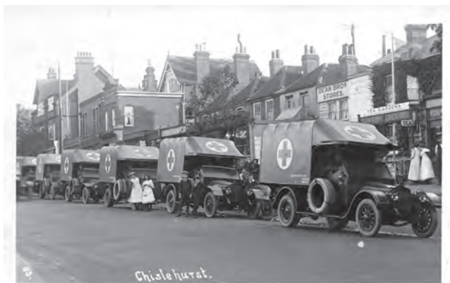
Ambulances queueing on the High Street

There appears to have been a lull in attacks, until August 1916,