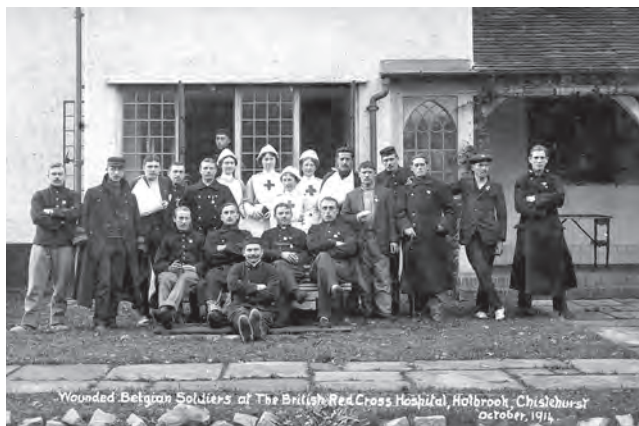
Injured soldiers at Holbrook Hospital.