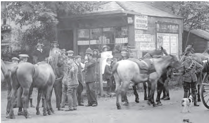
Horses being collected in Chislehurst, 1914.