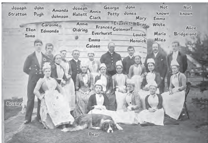
An earlier photograph of some of Foxbury staff