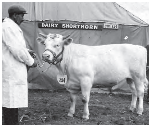
One of the prize heifers at Foxbury Farm