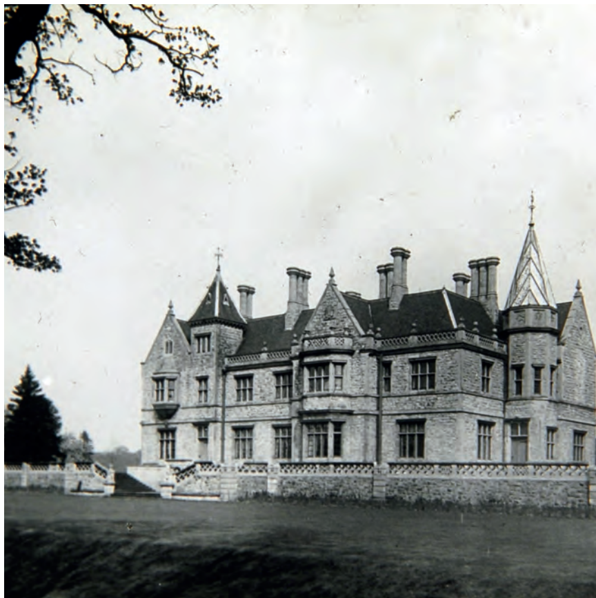
Foxbury from the west